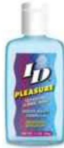
I.D. Pleasure – 1.1 Ounce Bottle

Now that you know all about the kind of lubrication you need, let's move on to the next section, and learn how to actually perform this amazing technique.